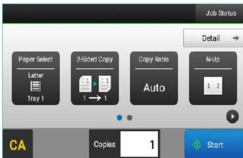
Easy Copy screen offers the most commonly used settings.