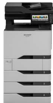
MX-C507F shown with optional paper drawers

Embedded solutions let users load and run software solutions tailored to their specific need or industry. Properly configured, apps installed on the MFP can interact with users' unique processes, applications and data repositories, with custom icons to drive each process, if desired.