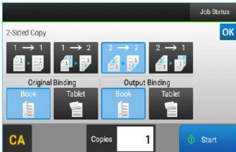
Easily copy documents in 1-sided or 2-sided formats.