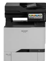
MX-C407F shown in standard configuration