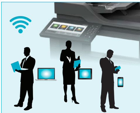
Optional wireless network interface for convenient scanning and printing from mobile devices.

*Some features require optional equipment and/or software/services.