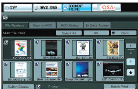
Sharp's easy-to-use Document Filing System with thumbnail preview*

The MX-M266N/M316N/M356N offer an optional high-performance, compact stapling inner finisher that can give documents a professional look and feel. Save time and money by minimizing outsourced jobs such as proposals, presentations or newsletters.