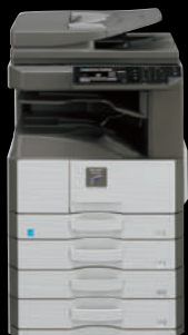
The MX-M316N shown with job separator.

1200 x 600 dpi resolution with standard PCL compatibility; optional PostScript 3 driver delivers robust performance.