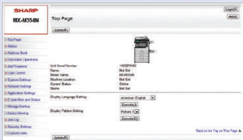
Embedded web page.