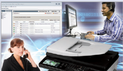
Sharp Remote Device Management.