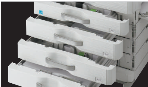
Available paper capacity stores up to 2,100 sheets with options.