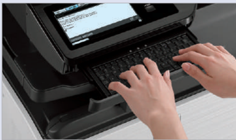
Easy-to-use optional, full-size, retractable QWERTY keyboard.