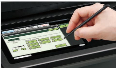
High-resolution touch-screen with stylus pen for easy point-and-touch operation.