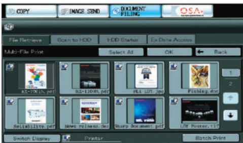
Sharp's easy-to-use document filing system with thumbnail preview.*