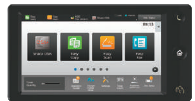
Award-winning 10.1" (diagonal) customizable touchscreen display.