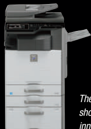
The MX-M564N shown with compact inner finisher.

On-board Document Storage Sharp's easy-to-use document filing system enables users to store frequently used files.