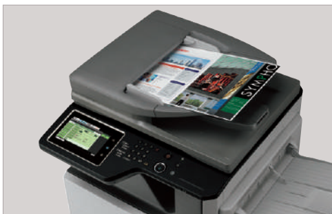
Standard 100-sheet RSPF scans up to 56 images-per-minute.