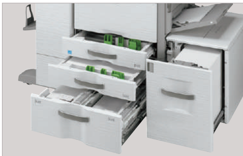
Up to 6,600-sheet paper capacity with available options.