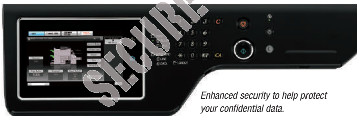
Enhanced security to help protect your confidential data.

The MX-M364N/464N/564N Essentials Series offers several layers of standard security to protect your business and user information . Standard features include data encryption, data overwrite protection, confidential printing and more. And, with Sharp's convenient End-of-Lease feature , all job data and user data can be easily erased at time of trade in.