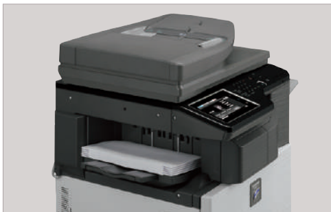
Available compact inner finisher with 50-sheet staple capacity.

A full-featured MFP that is also a strong value – the MX-M364N/M464N/M564N Essentials Series monochrome document systems will exceed your expectations.