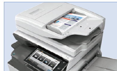
Sharp's ImageSEND™ feature provides one-touch distribution to email, cloud applications and more.