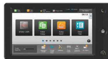
Award-winning 10.1" (diagonal) customizable touchscreen display.