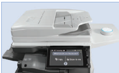
MX-M4071 shown with available Sharp MFP Voice feature with Alexa.