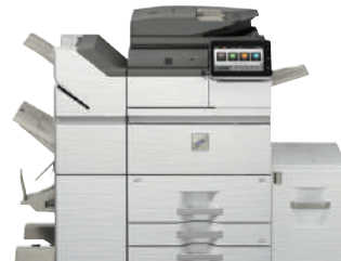
MX-M7570 shown with 3K saddle stitch finisher and large capacity cassette.