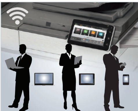
Built-in wireless network interface for convenient scanning and printing from mobile devices.

When it's time to get the job done, the MX-M6570 and MX-M7570 monochrome document systems are outstanding performers. Quickly scan documents at speeds up to 200 images per minute . Built-in optical character recognition (OCR) can convert your scanned documents into text-searchable PDFs or Microsoft Office file formats, simplifying your workflow. Use the manual stapling feature on select finishers to restaple your originals. Multiple finishing options give you the output you require, be it stacked, stapled or saddle-stitched. There's even an available built-in stapleless finishing feature, which can bind up to five sheets of paper by adding a crimp to the corner of the set, saving regular staples for larger sets.