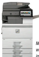
MX-M7570 shown with compact inner finisher.