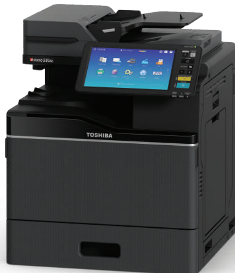
The e-STUDIO330AC/400AC Series is small enough for the desktop but big enough for the most demanding jobs with impressive features you'd expect to find on Toshiba's larger departmental MFPs.

This series not only has a compact footprint, but a compact carbon footprint. They are RoHS compliant, use recycled plastics, and have a Super Sleep (1W) Mode. They also reduce the environmental impact by being EPEAT Gold and Energy Star V 3.0 certified.