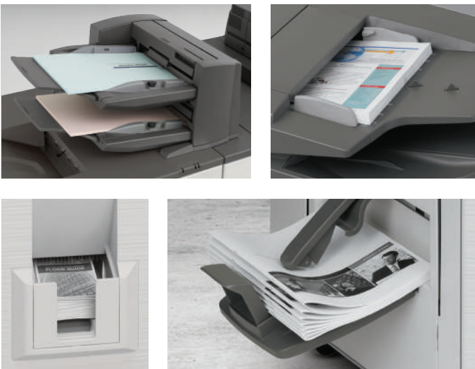
A large 250-sheet Duplex Single Pass Feeder (DSPF) handles your biggest jobs with ease. Time saving features like an interposer and a multitude of finishing options allow you to produce professional looking documents, brochures, and booklets.

At Toshiba, we go to great lengths to reduce our environmental impact, and yours. We rank in the highest levels thanks to accomplishments like being RoHS Compliant and ENERGY STAR® rated. The e-STUDIO1208 Series utilizes CO2 reducing plastics and toner, Energy Save and Eco Modes, Enhanced Power Shut-Off and Eco Scan as well as a reduced TEC value. We are always working to make sure our environmental impact is a positive one.