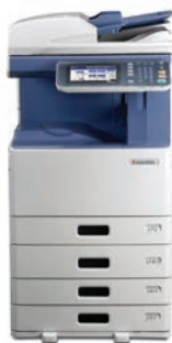
e-STUDIO2051c with Paper Feed Pedestal.