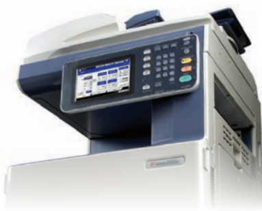
The large 7" VGA color touch panel tilts to any position to avoid glare and provide easy access.

maintenance. Instead of overhauling the entire machine, certain features can be restored with the replacement of a single component. The use of tandem printing with another e-STUDIO on the network reduces print time. And if a job is temporarily halted, job skip allows others to print around it.