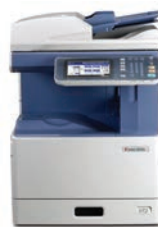
e-STUDIO2051c Base Model