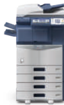
e-STUDIO306 with 50-Sheet Inner Finisher and Hole Punch.