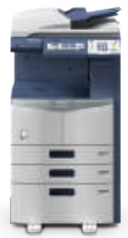
e-STUDIO306 with 2,000-Sheet LCF.