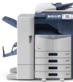
e-STUDIO306 with Saddle-Stitch Finisher.