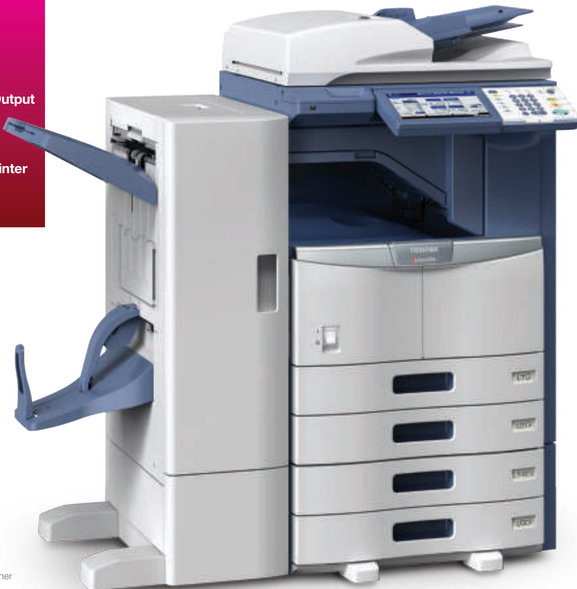
e-STUDIO306 with Saddle-Stitch Finisher