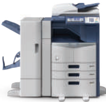
e-STUDIO306 with 2,000-Sheet LCF, Hole Punch, and Saddle-Stitch Finisher.