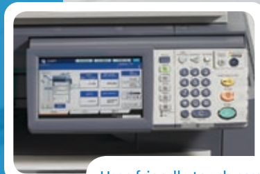
User-friendly touch-screen interface

Maintenance is also faster, easier, and better. It's that way by design. Toshiba's unique easy-to-replace consumable units can be swapped out in seconds, making servicing quick and easy.