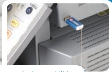
USB scan and print capabilities