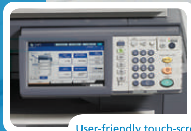
User-friendly touch-screen interface

Maintenance is also faster, easier, and better. It's that way by design. Toshiba's unique easy-to-replace consumable units can be swapped out in seconds, making servicing quick and easy.