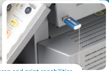
USB scan and print capabilities