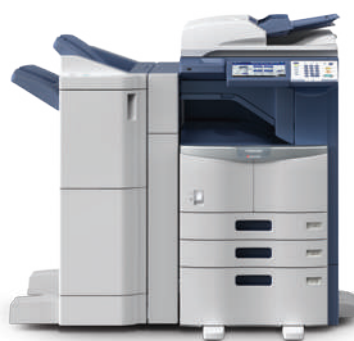
e-STUDIO456 with 2,000-Sheet LCF, Hole Punch, and 50-Sheet Staple Console Finisher.