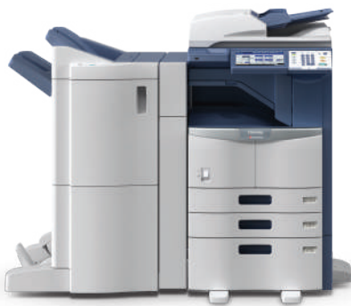
e-STUDIO456G with 2,000-Sheet LCF, Hole Punch, and Saddle-Stitch Finisher.