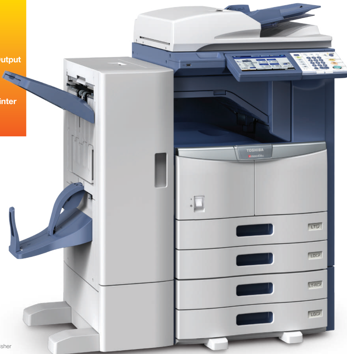
e-STUDIO456G with Saddle-Stitch Finisher