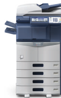
e-STUDIO456G with 50-Sheet Inner Finisher and Hole Punch.