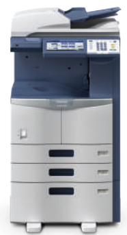
e-STUDIO456G with 2,000-Sheet LCF.