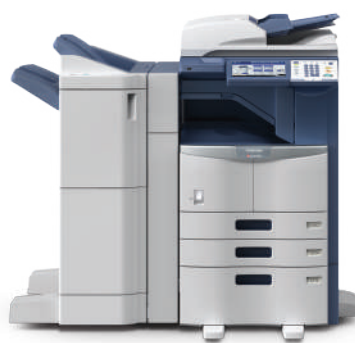
e-STUDIO456G with 2,000-Sheet LCF, Hole Punch, and 50-Sheet Staple Console Finisher.