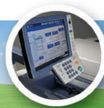
10.4" super VGA control panel