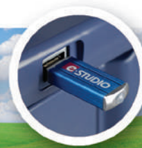
USB direct print from & scan to