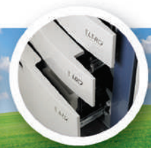
Auto paper size detection from every drawer