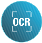
Optical Character Recognition

Higher Duty Cycles and Periodic Maintenance Intervals provide greater volume with fewer routine service calls so you can stay focused on productivity.