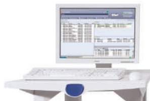
Xerox FreeFlow Print Server