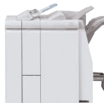
Booklet Maker Finisher with optional C-Z Folder (25 sheets or 100 page booklets)