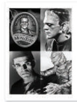
Squarefold Trim Booklet