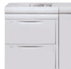
2-tray Oversized High-Capacity Feeder (4,000 sheets up to 13" x 19.2")