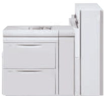
Oversized High-Capacity Feeder (2,000 sheets up to 13" x 19.2")