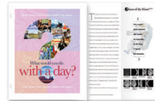
Color Inserts, Staple and Engineering Z-Fold

Our copier/printer lets you do more. Develop innovative, business-generating applications now and in the future.