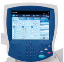
Integrated Copy/Print Server