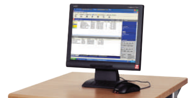
Xerox EX Print Server, powered by Fiery