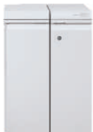
Interface Module and GBC AdvancedPunch