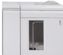
Interface Module and High-Capacity Stacker