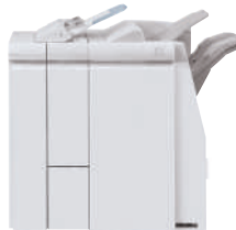
Standard finisher with optional C-Z folder (2-100 sheet, 3-position variable length stapler)