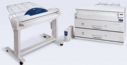
3. Printer with Scan System—includes AccXES controller and free-standing scanner