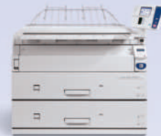
2. Copier/Printer—with the on-board scanner