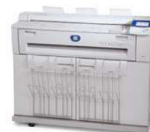
Digital Copier/Printer with Scan-to-File/-Net