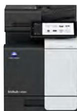
bizhub i-Series C4050i

So as your business grows, we will grow with you – seamlessly linking people and places to give a new dimension to document workflow and security management.