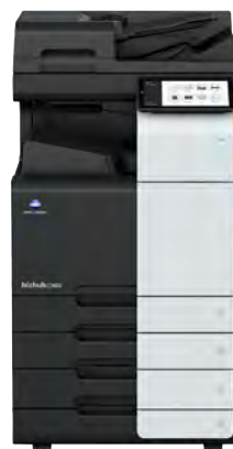
bizhub i-Series C360i