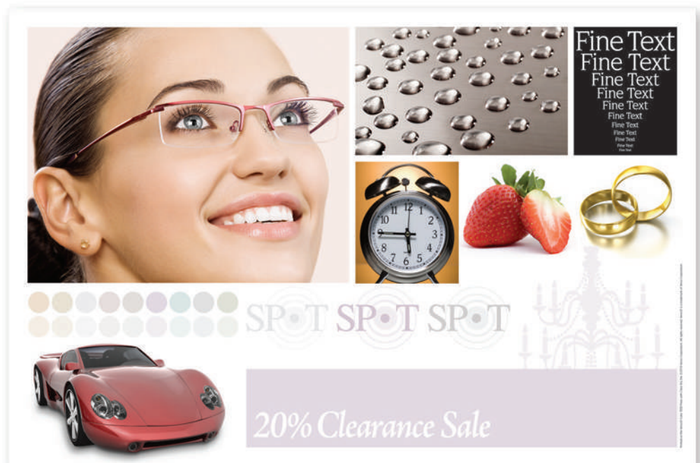
Base image without Clear Dry Ink areas.

The creative options you can offer by adding this new, Clear Dry Ink capability can help you become a true partner to your customers. You can advise customers already expert in design and layout on how to set up their files properly for this additional clear layer to achieve their desired effect. Or you can offer creative value to customers when they deliver their files, by adding some of these effects right at your print server.