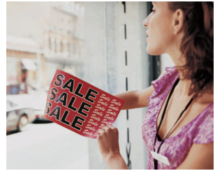
Xerox® NeverTear Window Signs

With our special polyester EA Low Melt Toner, the output fuses to polyester in a chemically bonding way, ensuring outstanding image quality on specialty substrates such as polyester and more – allowing you to offer a broader set of media choices. Premium NeverTear is water, oil, grease and tear resistant.