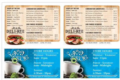
Image quality, ease of use, productivity, media latitude, feeding and finishing options, plus world-class workflow solutions are at your fingertips. Grow your digital color printing capabilities and reduce costs with the Xerox® Color 560/570 Printer.