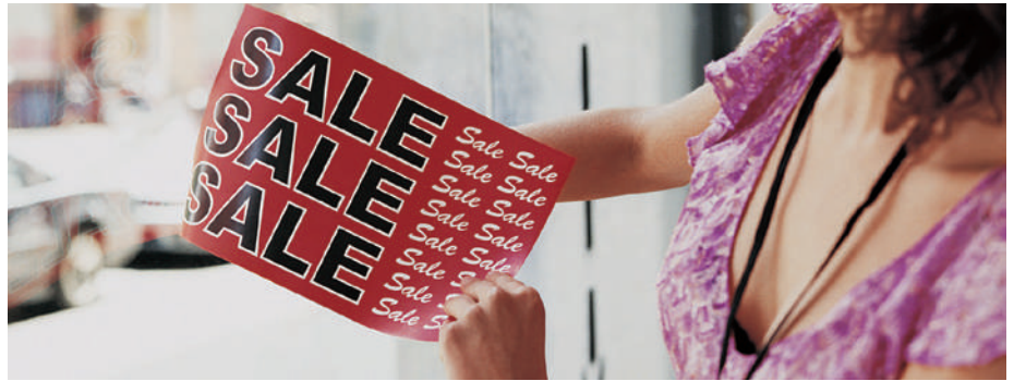
Xerox® NeverTear Window Signs

Our special polyester EA Low Melt Toner fuses the output to polyester using a proprietary chemical bonding methodology, ensuring superior image quality on specialty substrates including polyester and more. Our EA Toner including Premium NeverTear is water, oil, grease and tear resistant.