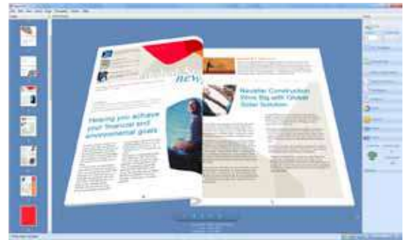
Xerox® Integrated Fiery® Color Server