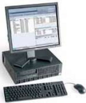
Xerox® FreeFlow® Print Server

Each server is designed to meet a specific set of workflow and application requirements. Your Xerox representative will help you choose the one that best suits your needs.