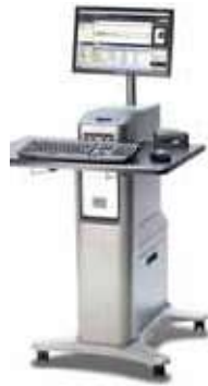
Xerox® EX Print Server, Powered by Fiery®*