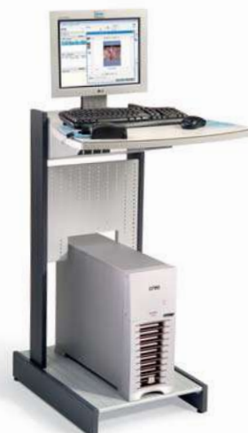
Stand is optional

The Creo® Spire™ Colour Server combines colour-management tools that yield superb digital colour with Variable Information solutions that provide all the programming and processing power you need.