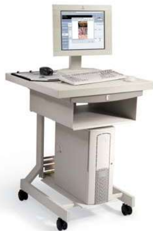
Stand is optional

The Xerox® FreeFlow™ DocuSP Colour Server is fast, powerful, and easy to use. Features include exception-page programming, job forwarding, and colour and print management. This server handles all kinds of Variable Information data effortlessly.