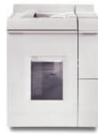
Basic Finisher Module