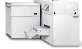
Watkiss PowerSquare 200