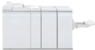
Plockmatic Pro 30/50 Booklet Maker (Available on 100/120/144/157 only)