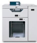
C.P. Bourg BSFx Dual Mode Sheet Feeder