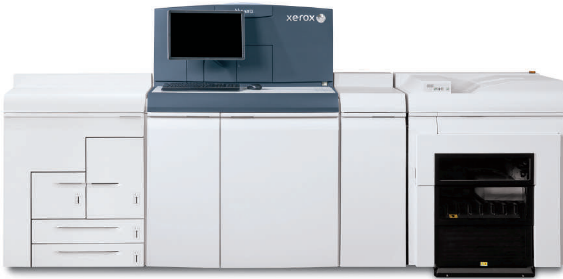
Xerox Nuvera® 157 EA Production System with Xerox® Production Stacker