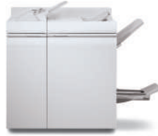
Multifunction Finisher Pro Plus