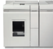
Basic Finisher Module Plus