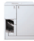
Xerox® Tape Binder