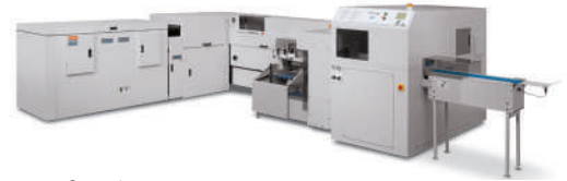
Xerox® Book Factory