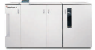
GBC FusionPunch II with Offset Stacker