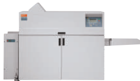
C.P. Bourg BDFNx Booklet Maker with Square Edge