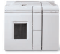
Basic Finisher Module – Direct Connect