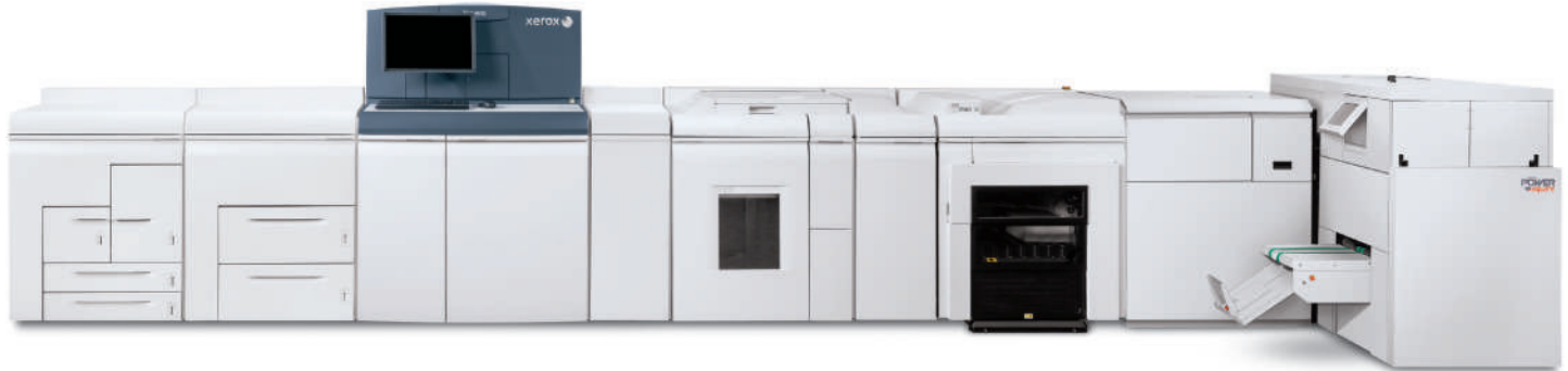
Xerox Nuvera® 157 EA Production System with Xerox® Production Stacker and Watkiss PowerSquare 200