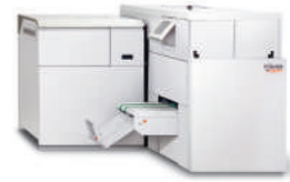
Watkiss PowerSquare 200