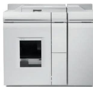
Basic Finisher Module Plus—Bypass