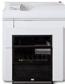
Xerox® Production Stacker