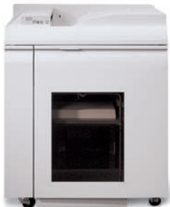
Xerox® DS3500 Stacker