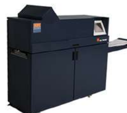
C.P. Bourg® BDF-e

For full bleed (three-sided trimming), the Bleed Crease Module (BCM-e) is offered as an optional device.