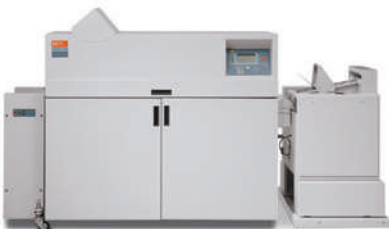
C.P. Bourg® BDFNx Booklet Maker with Square Edge