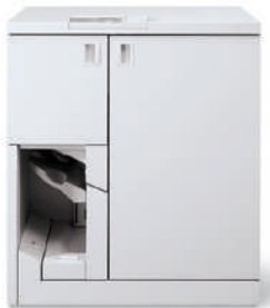
Xerox® Tape Binder