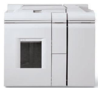
Basic Finisher Module—Direct Connect (BFM-DC)