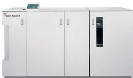
GBC® FusionPunch® II