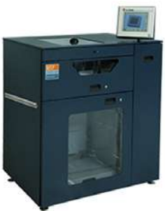
C.P. Bourg® Dual-Mode Sheet Feeder (BSF)