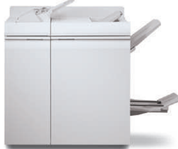
Multifunction Finisher Pro Plus