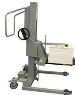
Production Media Cart