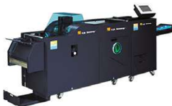
C.P. Bourg® BM-e Booklet Maker

Adding a perfect finishing device to your Xerox Nuvera® 200/288/314 Perfecting Production System and Xerox Nuvera® 100/120/144/157 Production System has never been easier. You'll appreciate the variety of outstanding inline finishing solutions that are available from Xerox to help you quickly and efficiently produce high-quality bound documents. We offer you the widest range of finishing options you need to wrap up your jobs professionally.