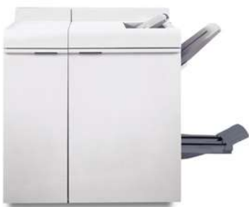
Multifunction Finisher Professional