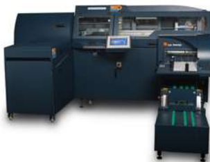
C.P. Bourg® 3202 Perfect Binder