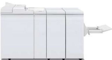
Plockmatic Pro 50/35 Booklet Maker

*Available on Xerox Nuvera® 100/120/144/157 EA Production Systems