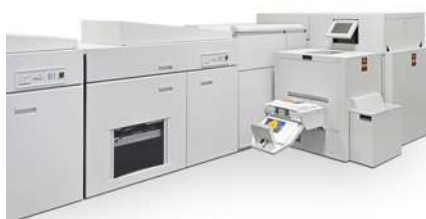
Watkiss PowerSquare™ 224