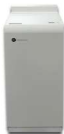
GBC® AdvancedPunch™ Pro