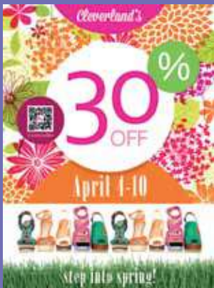
Point of Sale

Producing large quantities of wide format jobs used to be a trade-off , requiring multiple printers and multiple days to fulfill even a single customer request. It's no wonder that these jobs have sometimes been viewed as a problem. But with the Xerox Wide Format IJP 2000, they are a profit opportunity.