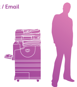
WorkCentre 7300 Series with High Capacity Tandem Tray Option